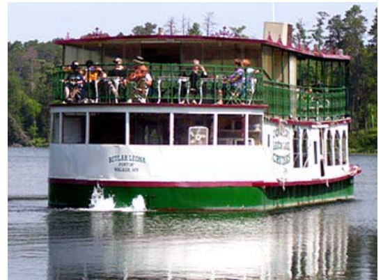
Lake Itasca, Minnesota