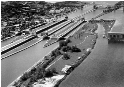
Soo Locks, Sault Ste. Marie

We will travel along the shores of Lake Michigan, with a lunch stop today in Sault Ste. Marie. Later this afternoon we'll enjoy a unique experience while touring the locks of