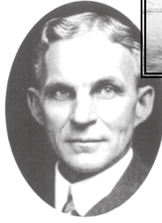
Henry Ford 1863 - 1947 and his Fort Myer winter estate

Responsibility: Wendinger Travel acts only in the capacity of an agent for the passengers in all matters pertaining to hotel accommodations and as such is not responsible for any damage, expense or inconvenience caused by late arrivals or departures or by any change of schedule or entertainment schedule or other conditions, nor for the loss, injury or damage to any person or property from any cause whatsoever. Fuel and Insurance for the rental car are not included. The right is reserved to decline to accept or retain any person as a member of this tour at any time.