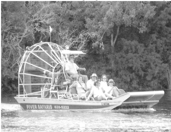
Airboat Ride of the Everglades

the baseball enthusiast, additional games will be offered for $30 each. One of the additional games may even be at the City of Palms Park, the home of the Boston Red Sox. While in Fort Myers choose between having your own rent-a-car or being chauffeured to the area attractions by van. Mini-Vans will be available for groups of four. A $35 discount per person will be given for the mini-van. If you rent a vehicle you are responsible for the fuel and can either use your existing automotive insurance or purchase additional. Majestic royal palms line the streets of Fort Myers, a city with more than 70 varieties of palms and a profusion of exotic flowers and tropical fruit. Some of the options you have while in the Fort Myers area are: attend additional Twins Baseball games, shop, golf, spend time on the beach, have an airboat ride, tour the Sea Shell Museum or take a trip to Sarasota to visit the Ringling Museum. The City Yacht Basin area is the town's boating center. Boating is