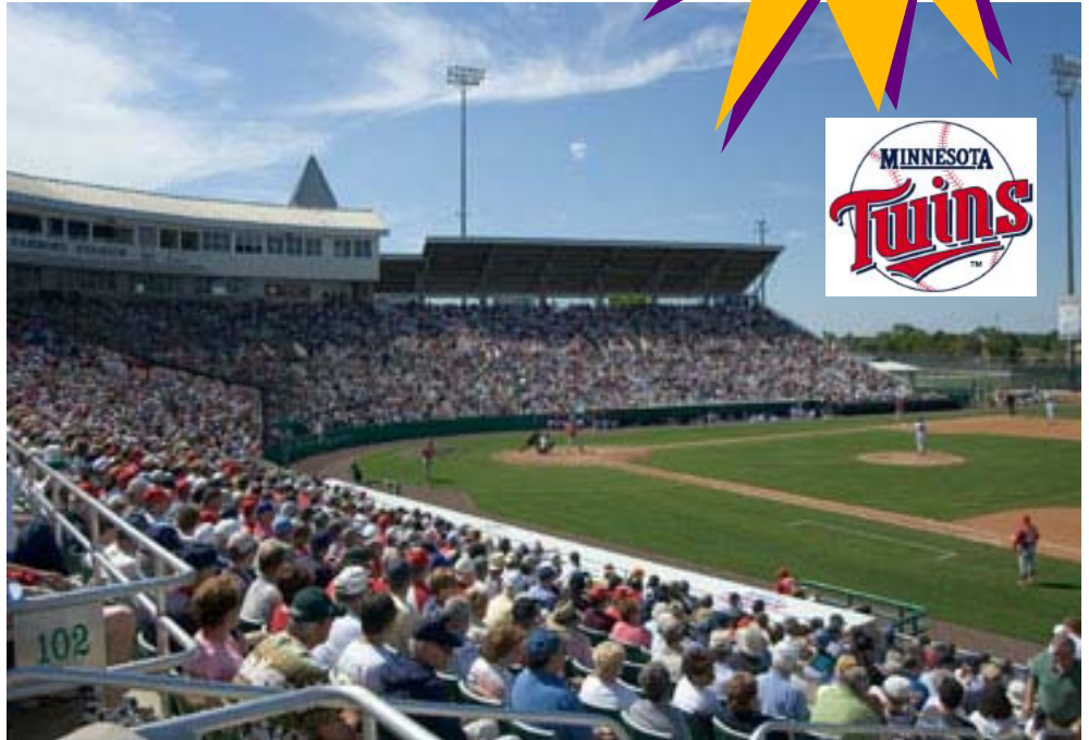
Lee County Stadium, winter home of the Minnesota Twins

A warm week of Florida sunshine awaits us, and Fort Myers is an exciting place to spend an early spring get-a-way. You will have the opportunity to watch the "boys of summer" in their spring training games. There will be one included game at Lee County Stadium on Hammond Field, the winter home of the Minnesota Twins. The schedules of these games are not announced until January 1st. For