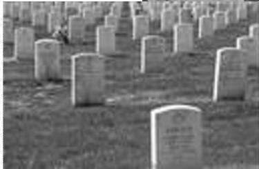
Arlington National Cemetery