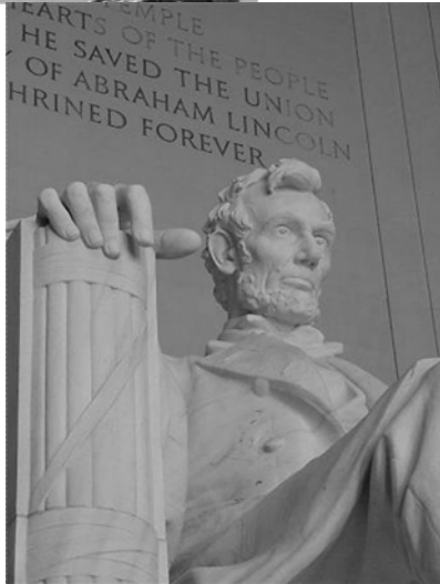
The Lincoln Memorial