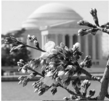
Our Nation's Capitol enclosed by the beautiful cherry blossoms