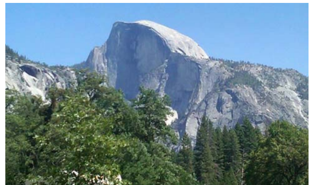
Half Moon Dome, Yosemite National Park

Yosemite National Park is our attraction for today. Glaciers transformed the rolling hills and meandering streams of Yosemite. Abraham Lincoln set aside this breath-taking scenic area to become a national park in 1864, home to majestic rock and it's formations such as Half Moon Dome and El Capitan. For lunch we will have the opportunity to shop and browse in the Yosemite Village. As we leave the park we will travel west toward Oakland and San Francisco for our evening stay at the Hampton Inn in Hayward, CA for the next two nights.